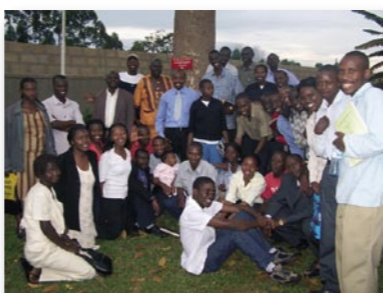
Kyambogo Mission Participants