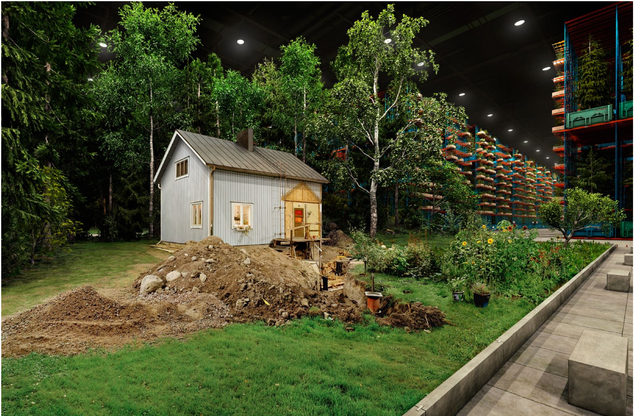
House with Garden – Unique opportunity, 2011